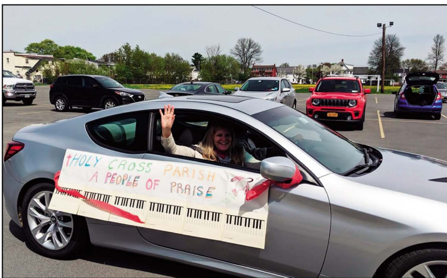
Parishioners of St. Peter's Church, St. John the Baptist Church and Our Lady of Victory Church in Plattsburgh recently held a car parade in the parking lot at St. Peter's Church, greeting the priests and seminarians currently serving in the community. The parish was aided with traffic control by local Knights of Columbus and Boy Scouts.